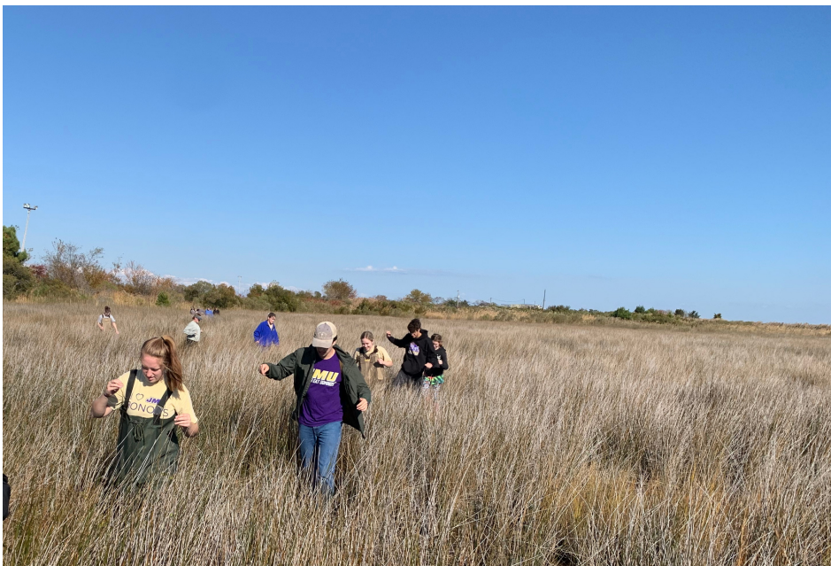
STUDENTS EXPLORING THE MARSH