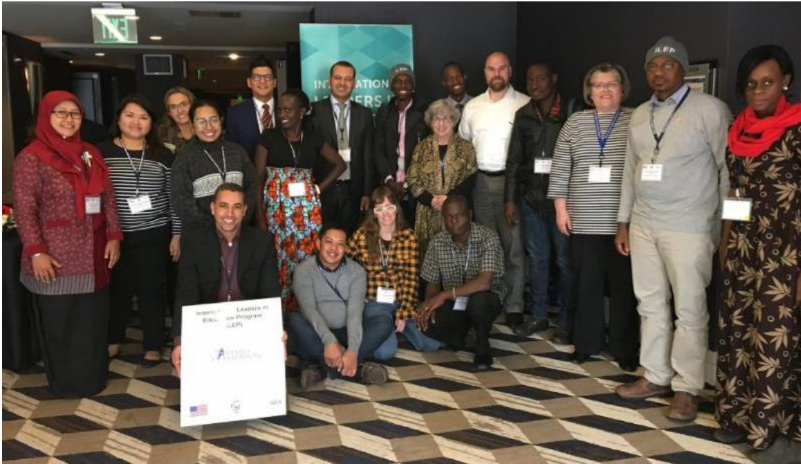
The 2017 International Leaders in Education Program (ILEP) Fellows.