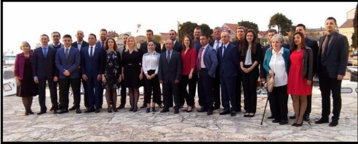
CISR faculty and staff with the 2017 Senior Managers' Course participants.