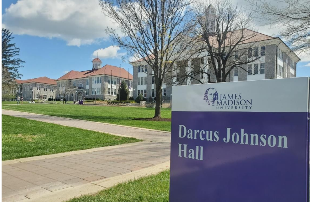
Signage for Darcus Johnson Hall on the JMU Quad