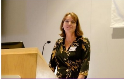
Office of Sponsored Programs ▶